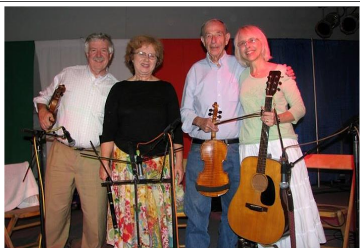
Comhaltas musicians play at the Irish Festival 2014