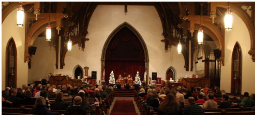
Christmas Concert 2013 at The First Baptist Church, Fairport

For workshops and admission to the concert: $25