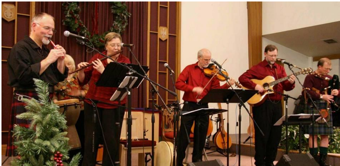
The Christmas Ceilidh Band

At the Caledonia First Presbyterian Church in Caledonia, NY