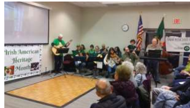
Siamsa at Webster Library