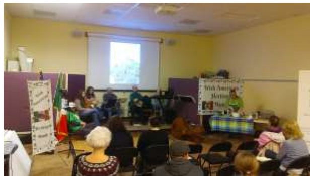
Siamsa at Ogden Library