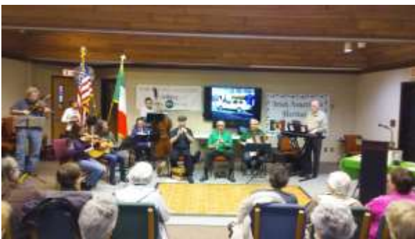
Siamsa at Henrietta Library