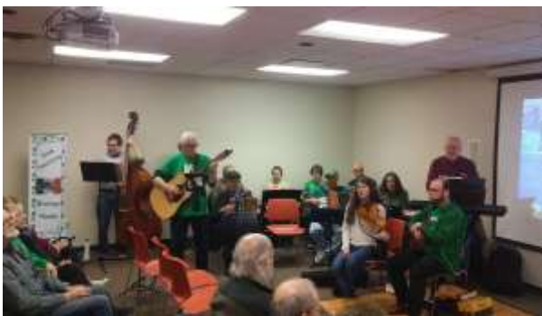
Siamsa at Penfield Library