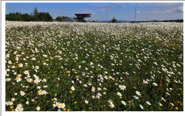
Dog Daisy Afternoon. A field of Dog Daisies near the Curragh racecourse in County Kildare. (from The Irish Echo, June 22, 2021)